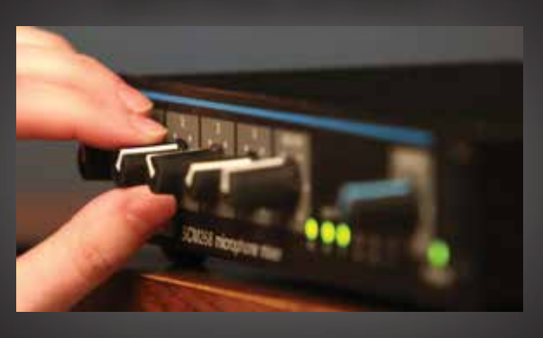
Clean, crisp sound that's easy to hear.